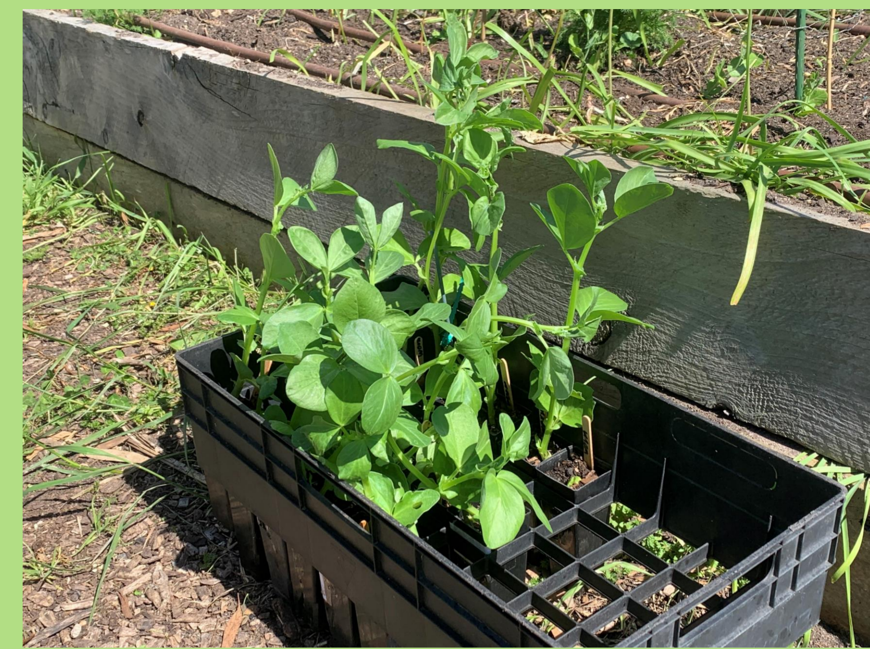
Our Plant Bar Graph

Aim: We are trying 2 different fertilisers to see which one is best for the garden. We will measure the height of Broadbean seedlings to see which one grows the tallest. We are using water as a control.